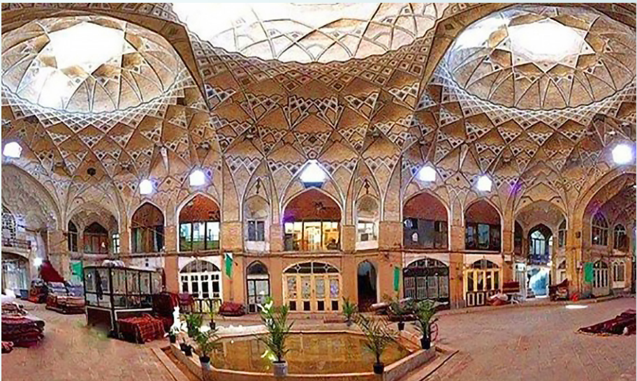
Zanjan Great Bazaar