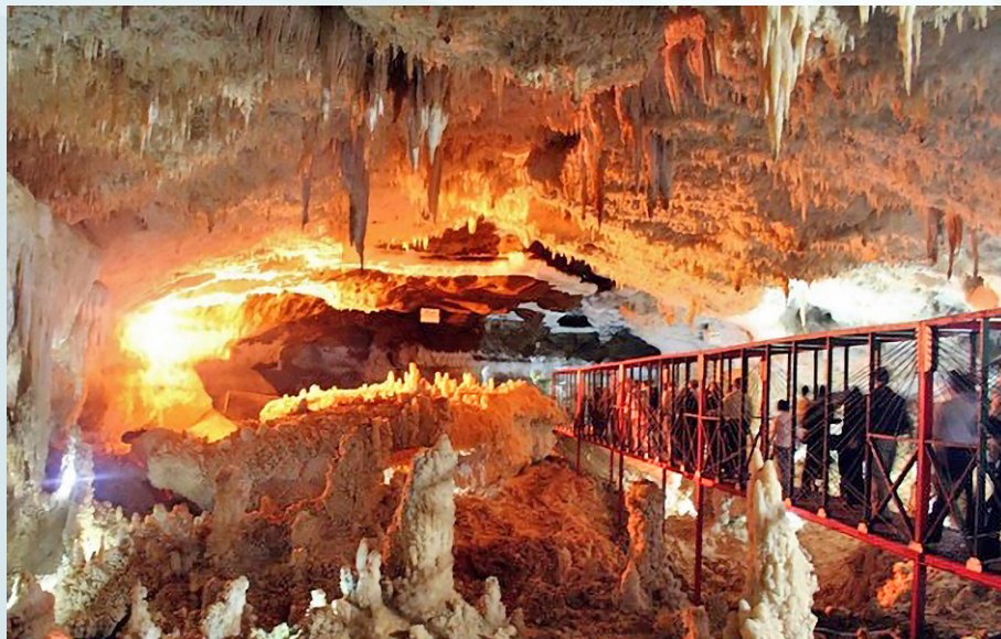
Katale Khor Cave

One of the most spectacular tourist attractions in Zanjan province is a beautiful limestone cave called Katale Khor. This cave, which is considered one of the most amazing caves in the world, is located in Khodabandeh city, approximately 87 km from Zanjan.