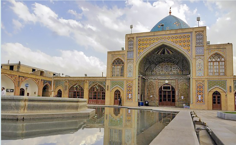
Jame'a Mosque of Zanjan